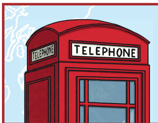
The Telephone Box